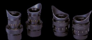
Night eyepiece Daytime eyepiece

Bundled items: Objective lens caps, horn-rims for the eyepiece and CR123A lithium battery.