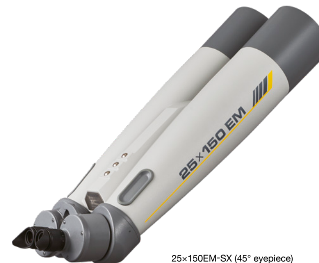
25x150EM-SX (45° eyepiece)