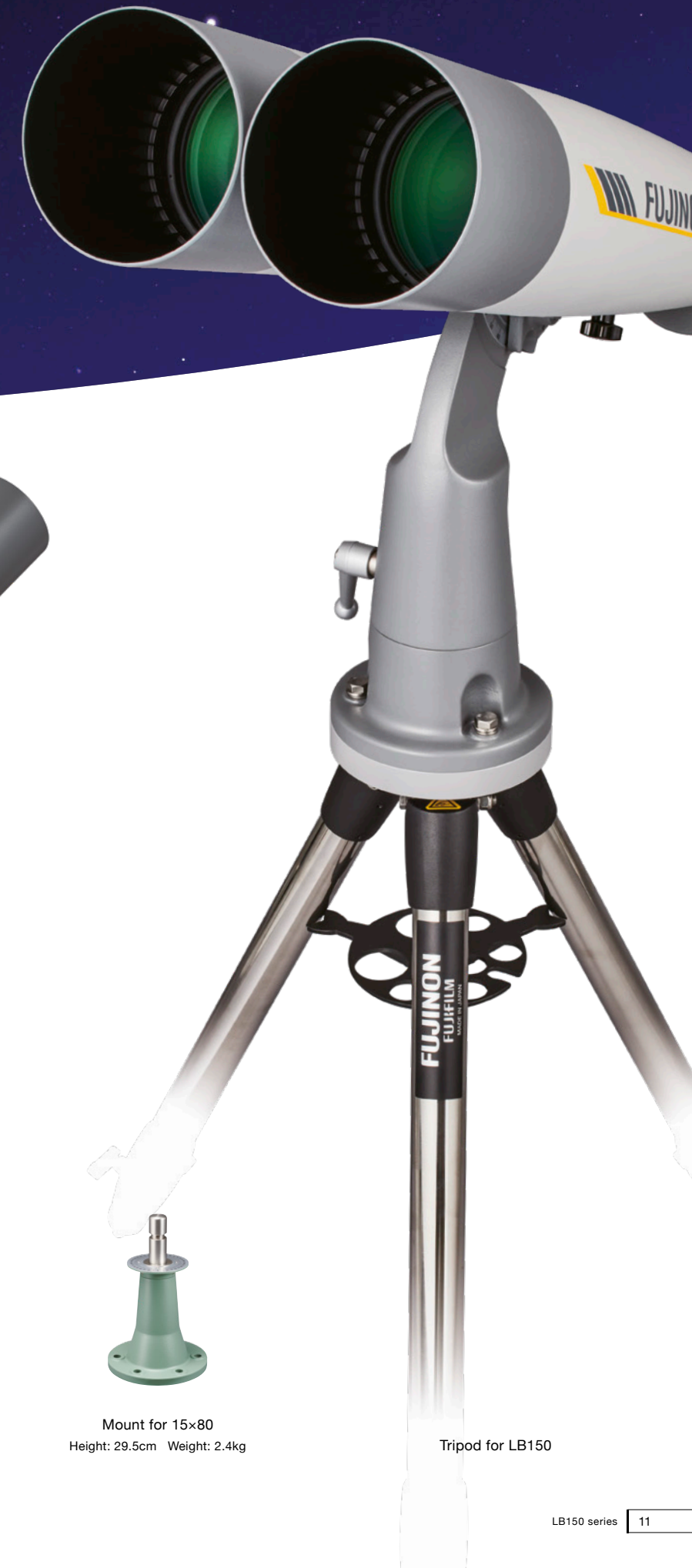
Tripod for LB150