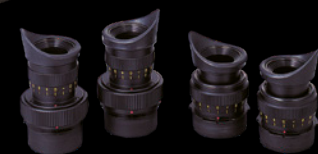
Night eyepiece Daytime eyepiece