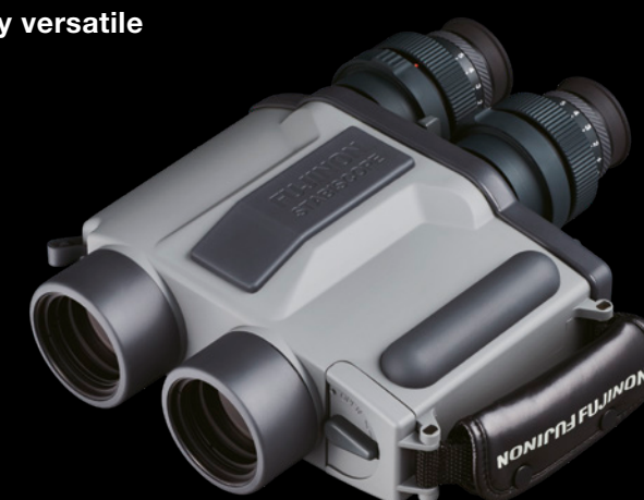
S1240-D/N (12×40) with the night eyepieces.

Bundled items: Neck strap, hand band, carry case, DC regulator, input and output cords (for DC regulator), and 4 AA Alkaline batteries.