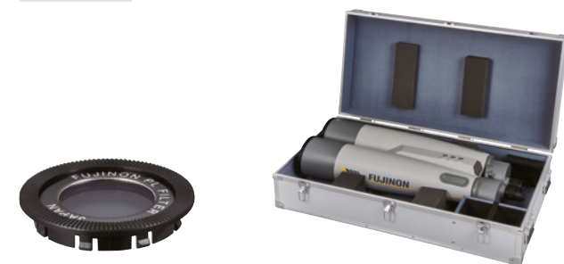
LB150 Polarizing filter (1pc)

Bundled items: Objective lens cap and winged eyecup.