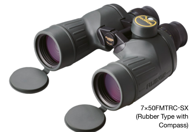
7×50FMTRC-SX (Rubber Type with Compass)

Bundled items: Objective lens covers, eyepiece rainguard, soft case, and neck strap.