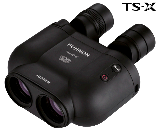
TS-X 1440 (14x40)

Bundled items: Lens cap, eyepiece caps, case, strap and 4 AA alkaline batteries.