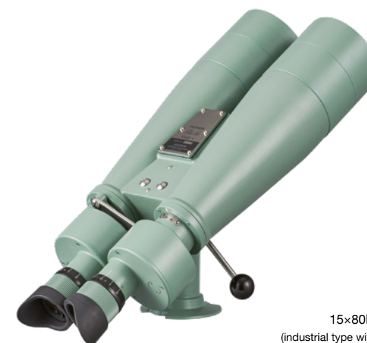
15x80MT-SX (industrial type with case)