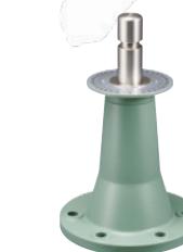
Mount for 15x80 Height: 29.5cm Weight: 2.4kg